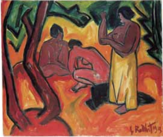
Karl Schmidt-Rottluff (1884–1976) In the Forest , 1913 Oil on canvas, 87 x 102 cm LWL-Museum für Kunst und Kultur. Westfälisches Landesmuseum, Münster

German Records is an artistic journey from Berlin to Paris in which German classic modern artists and old masters establish a dialogue with Pablo Picasso. The show reveals the divergences, reactions, antagonisms and affinities the Spanish artist aroused in the context of the German art explored in the show.