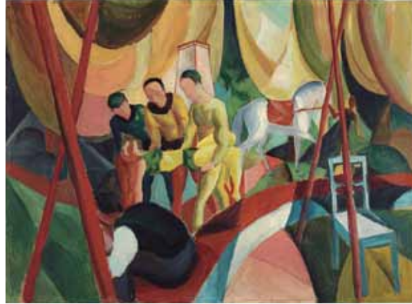
August Macke (1887–1914) Circus , 1913 Oil on cardboard, 47 x 63.5 cm Museo Thyssen-Bornemisza, Madrid

Putting an end to the old aesthetics of the 19th century, the great cities of Paris and Berlin, the unsettling new scenarios of cultural life, boosted the circulation of numerous artists and intellectuals during the first third of the 20th century, and with them an intense flow of creative ideas and proposals. Most of the episodes