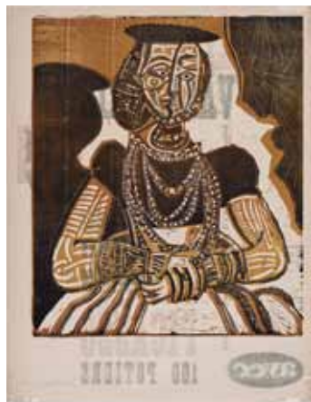
Pablo Picasso (1881–1973) Portrait of a Young Girl, after Cranach the Younger, II, 4th July 1958 Color linocut. Second state of 'Bistre and Noir plates', 79.5 x 60 cm

We invite visitors to roam the exhibition on an open itinerary where artworks, historic documents, photographic testimonies or quotations by the artists and those close to them come together in a rich reference archive. We hope it will help towards a better understanding of the beautiful cultural legacy these artists left to the western history of the image, and a fuller appreciation of the value of their contribution at a time as difficult and perilous, yet as exciting, as that of the Europe of these classic moderns.